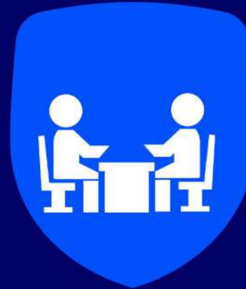
Face to Face