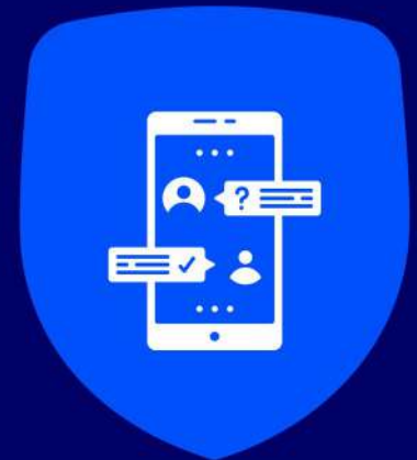
Online Account, Social media and Web Chat