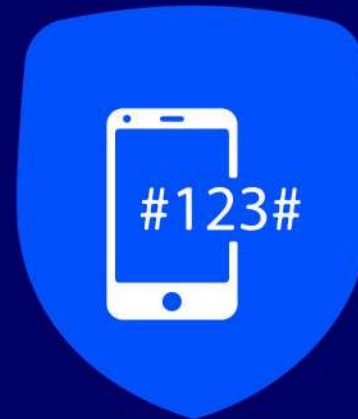
Mobile App, USSD and Short code